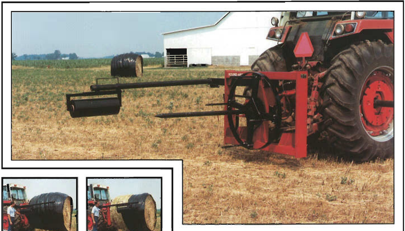
The Round-About® universal hay tool allows a single operator to wrap most bales quickly and easily.