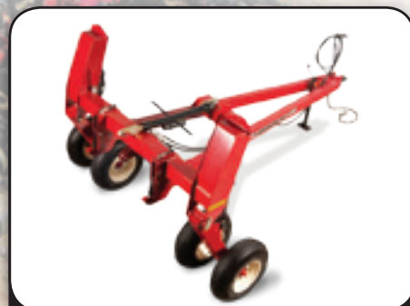
Easily convert any size Ripper-Stripper implement to pull-type operation with model 700, 500 or 300 implement caddys, or pull-type, bolt-on conversion packages.