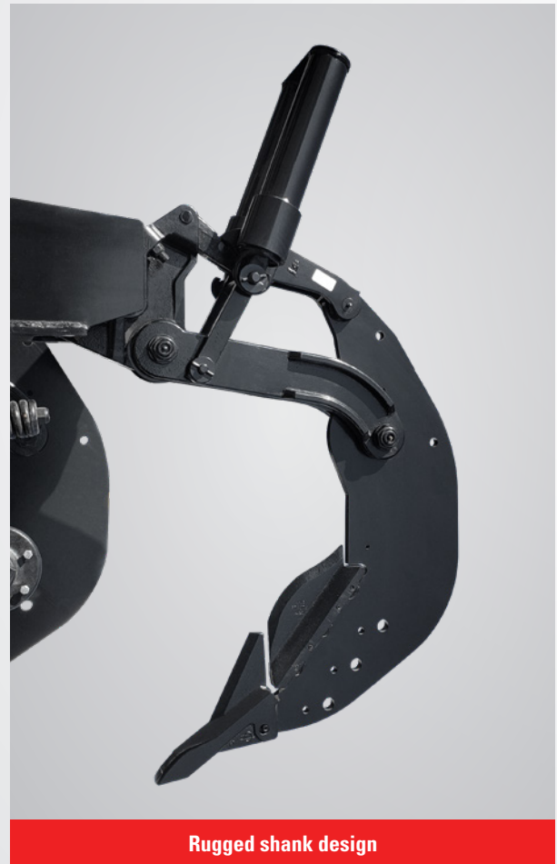
Rugged shank design