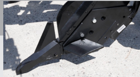
Optional shatter wings and shank protectors